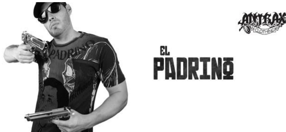
Figure 3. Advertisement of “El Padrino” style of Antrax Clothing. (From “Antrax Clothing,” 2012, http://www.antraxclothing.com/index.php )

millionaire.” 80 An example of Antrax clothing is shown in Figure 3. The original Antrax Clothing was decorative military vests inspired by the vests that many DTO members wear that contain a variety of pockets and compartments to carry short-wave radios, weapons, and ammunition. 81 The popularity of Antrax clothing line is demonstrated through the 128 videos available on YouTube regarding Antrax clothing, the 15,486 people who have “liked” Antrax on Facebook, the 409 followers Antrax has on twitter, and that over half their online merchandise is sold out. 82 Antrax clothing accommodates both the original cowboy style narcomoda in Mexico and the more modern narcomoda available throughout the United States, Mexico, and Canada.