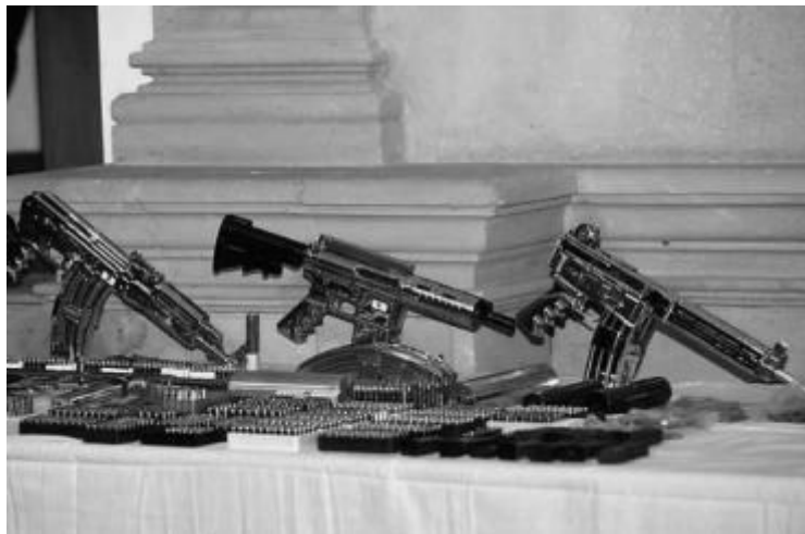
Figure 7. Weapons and bullets plated in gold, located in el Museo de Enervantes.

symbolic and fashionable, they represent “rebelliousness, edginess, and danger,” much like rap, hip-hop, and the clothing associated with these genres. 125 The images of narcocultura, the clothing, the music videos, and the newspaper articles represent resonate with a variety of audiences because they have the “cool factor” and others desire to be like them. Narcocultura glamorizes violence; the blog “La Poca Madre de los Poderosos” describes el Museo de Enervantes , or the museum dedicated to the drug war located in the Secretaría de la Defensa Nacional . The museum is not open to the public, and is intended for military use only. One room in the museum displays a variety of jewel encrusted firearms, gold bullets, a gold plated handgun embossed with a portrait of the Virgin of Guadalupe (see Figure 7). A more recent addition to the collection was one of Alfredo Beltrán Leyva’s pistol embossed with a figure of Emiliano Zapata and the saying “Más vale morir de pie que vivir en rodillas.” or “It is better to die on one’s feet than live on one’s knees.” 126 These extravagant weapons romanticize violence and killing providing resonance and rhetorical force for those involved in the drug trade.