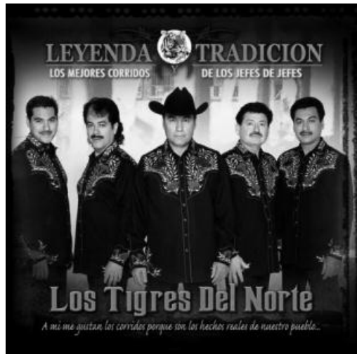
Figure 1. The typical norteña narcomoda as displayed by Los Tigres del Norte.