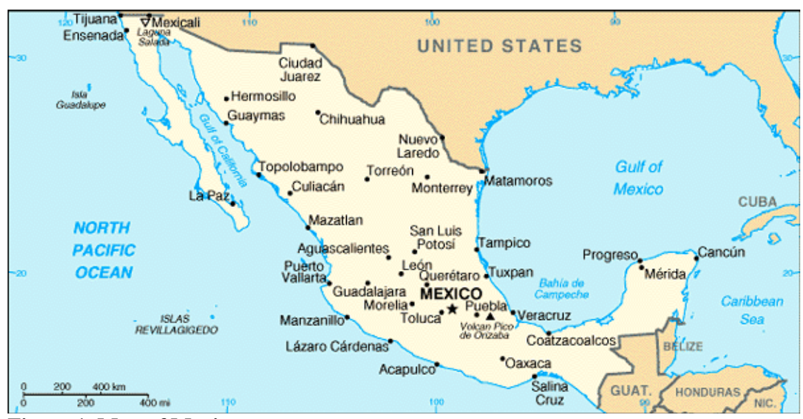
Figure 1. Map of Mexico.

The political structure of Mexico has continued to evolve since gaining its independence from Spain. Like many other Latin American countries, Mexico has struggled with finding its national identity following the revolution. The political culture and processes of modern Mexico are indeed a reflection of its own vibrant, but at times troubled, history. A full and detailed history of Mexican politics is, however, beyond the scope of this thesis. Instead, a historical overview of the political processes, parties, actors, and branches of government shall be examined. Democratisation and the electoral process within Mexico are also relevant to the study of corruption. More recently, the continuing rise of narcoterrorism within certain areas of Mexico has provided even more opportunities for corruption. Therefore, it is important to understand how these aspects of Mexican politics contribute to the overall problem of persistent institutionalised corruption at the local, state, and national levels.